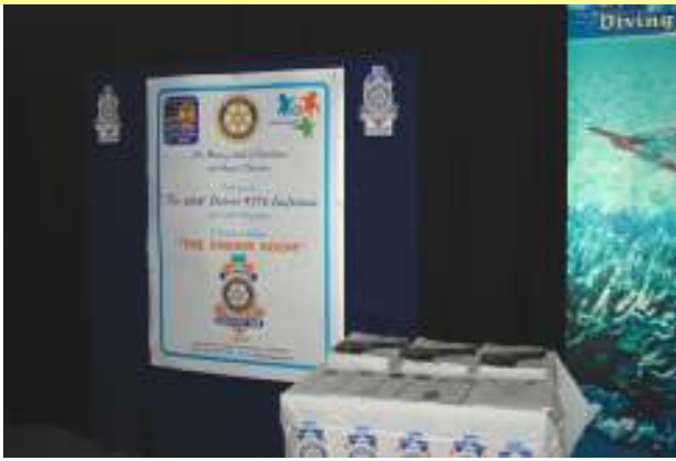
Gladstone conference promotion