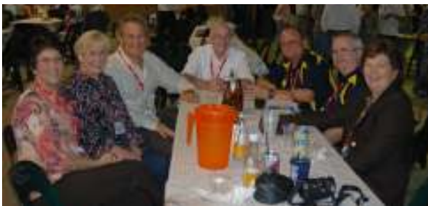
Mackay mob at the welcoming dinner