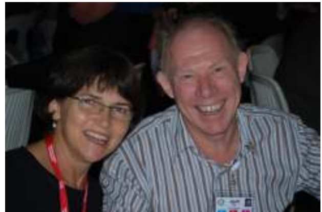
Happy raffle winners