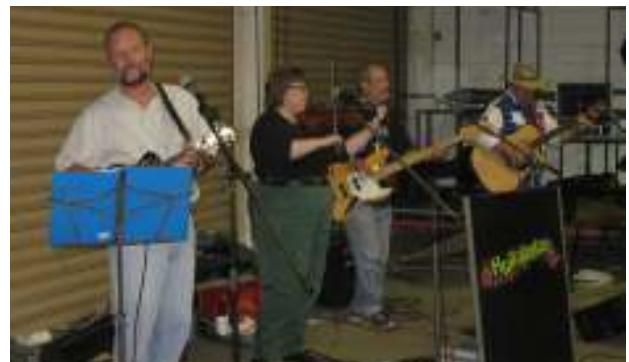
Friday night entertainment